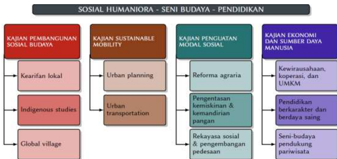
Figure 2. RIRN 2017-2045