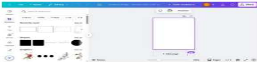
Gambar 2. Menu Fitur Pengeditan Pada Aplikasi Canva

Artboard is ready available, thing the signify that Canva app ready For used as manufacturing A design graphics. At this stage This is beginning The initial process of developing a digital booklet media based on Canva for the Deutsch im Hotel course (A. Rohma & Sholihah, 2021). In order to be able to make appearance a digital booklet media is increasingly interesting, then can done editing or adding elements, stickers, and text in the section side page Canva app. With help features the besides help to make appearance a digital booklet media is increasingly become more interesting, features also contributes For help convenience in the development process something products that will be will produced in order to be able to in accordance with desire and can used with easy by students (Penelitian & Maulia, 2023).