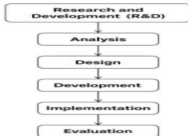
Figure 4. Research Flow

This research is study quantitative in nature correlation, which involves something related variables between variables One with other variables (Nasution, 2019). It can be understood that study correlation quantitative is research conducted look for influence from two variables to be researched later known how much big its closeness (Lieser et al., 2018).