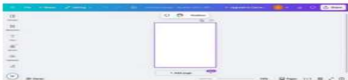
Gambar 1. Artboard Baru

At the stage This development of Canva -based digital booklet media for Deutsch im Hotel course skills, things the first one that can done is open application or Canva web and press knob search in section on page Canva application with the keyword or key word "Booklet", thing this is very important implemented because the size paper in accordance with design graphics that will created. After pressing knob the so will appear "Create a blank booklet (A4)" view or can also be called as a regular "Artboard". marked with box white like image below :