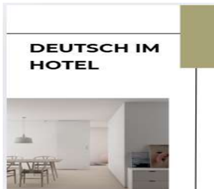
Figure 8. Booklet Cover Appearance