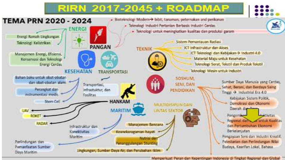
Figure 3. PRN Theme 2020-2024 Local Wisdom ( Wisdom Local )