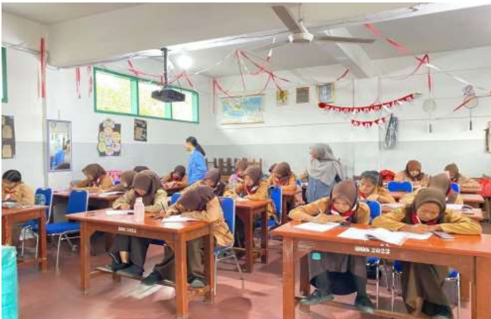
Figure 1. Documentation of the Classroom Situation During Data Collection through a Research Questionnaire on "Students' Difficulties in Understanding Descriptive Texts"

Therefore, teachers should create more engaging classroom environments, use topics relevant to students' interests, and encourage extensive reading to foster positive attitudes toward reading. Finally, the discussion demonstrates that students' difficulties in understanding descriptive texts are rooted in a combination of linguistic, cognitive, and affective factors. These findings are consistent with previous research (Sari, 2018; Rahman & Yusuf, 2020; Dewi & Sitorus, 2022), which also identified vocabulary limitation, lack of strategies, and low motivation as primary challenges in reading comprehension. By linking the present results with established theories, it can be concluded that improving students' reading comprehension requires integrated instruction that addresses vocabulary, structure, strategy use, and motivation simultaneously. This pedagogical implication reinforces the importance of teaching reading as an interactive, meaning-making process rather than a mere translation activity.